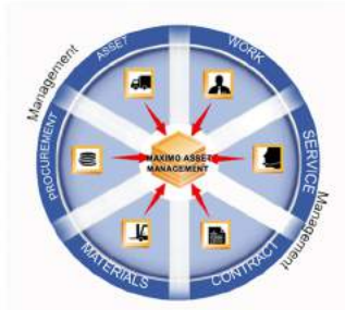
Maximo Asset Management Solutions

We can be your resource for all things Maximo; whether you need additional licensing, are getting ready to implement or upgrade, or need some extra training or support.