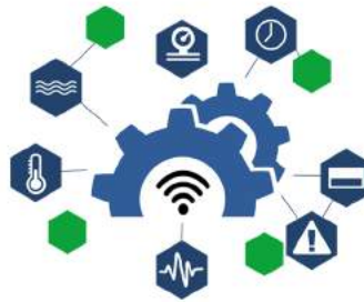
Connected Maintenance™ Solutions

We can be your resource for all things Maximo; whether you need additional licensing, are getting ready to implement or upgrade, or need some extra training or support.